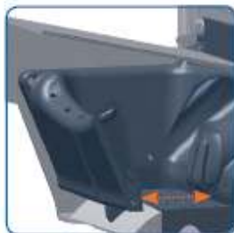
Effective automatic cleaning of the burning chamber.