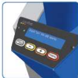
Easy to use control panel